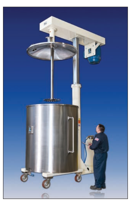
Vacuum-design high-speed disperser with air/oil hydraulic lift for easy access into the 600-gal mixing vessel.

sification of ceramic materials must be comparatively low speed and low shear.