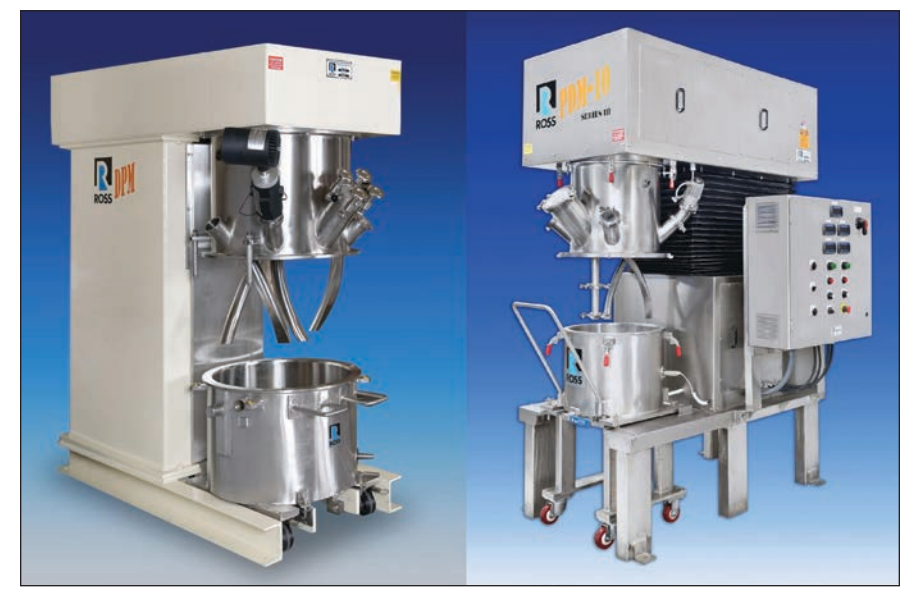
Double planetary mixer with helical stirrers (left) and hybrid planetary disperser with helical stirrer and two highspeed saw-tooth blades (right).

For extremely viscous and stiff dispersions, horizontal kneaders and kneader extruders remain the most powerful high-torque mixing tools of choice. Also called a double-arm sigma blade mixer, a kneader is composed of