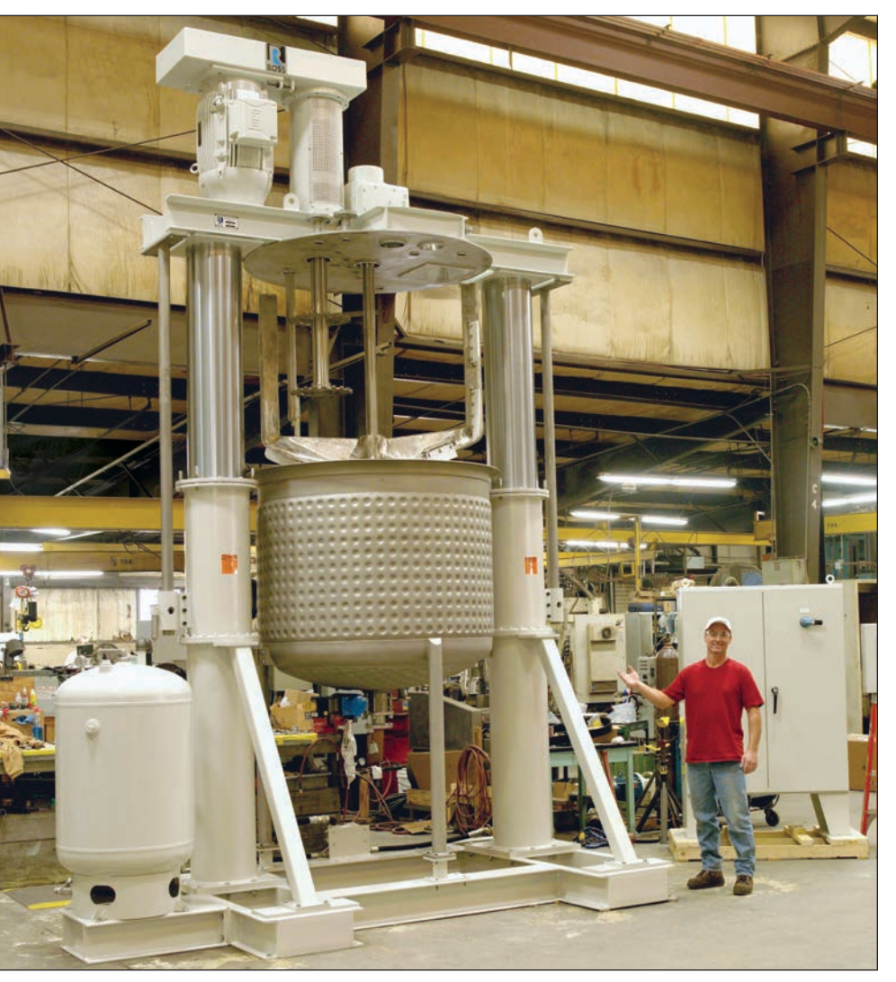
500-gal multi-shaft mixing system with independently controlled high-speed disperser and anchor agitator.

Mixing strategies for ceramic powders differ from one application to another.